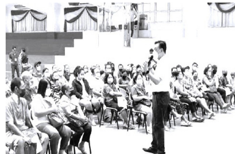
CityGovBacoor www.bacoor.gov.ph P/OBacoor

Patunay lamang ito na prayoridad ang makapagbigay ng serbisyong nakakaabot sa pangangailangan ng ating mga kapwa bacooreño.